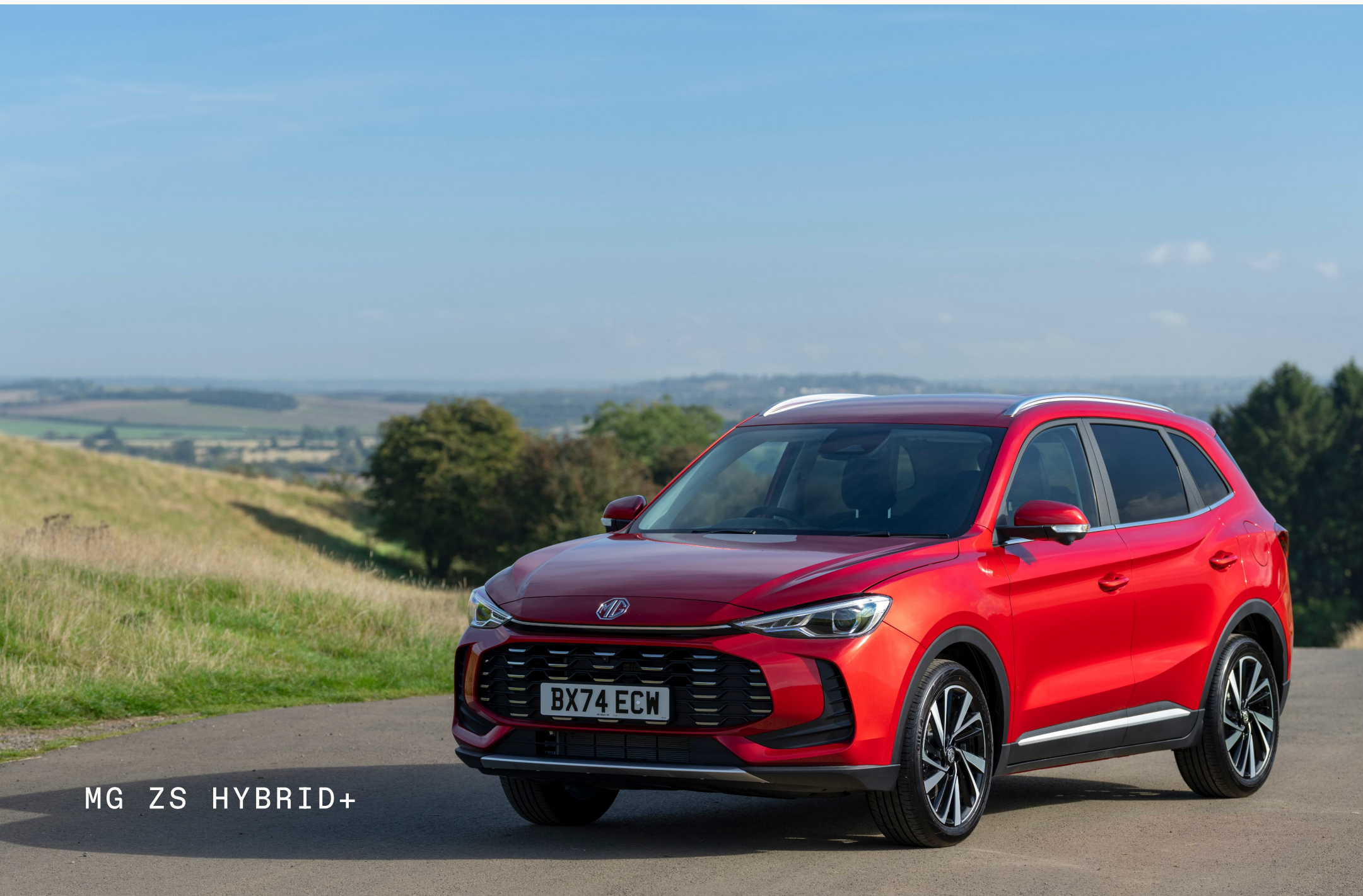
MG ZS HYBRID+