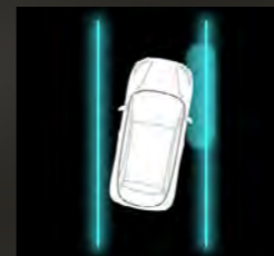
Lane Keep Assist