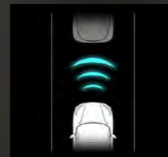
Traffic Jam Assist