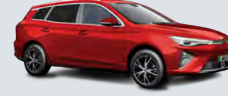
DYNAMIC RED TRI-COAT PAINT*

*Tri-coat and metallic paint optional at extra cost.