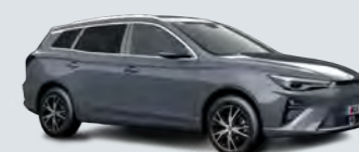
HAMPSTEAD GREY METALLIC PAINT*