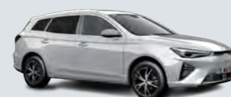
COSMIC SILVER METALLIC PAINT*