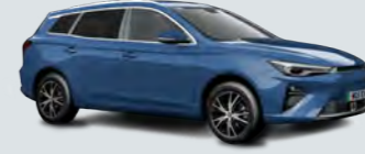
PICCADILLY BLUE METALLIC PAINT*