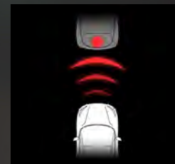
Active Emergency Braking (AEB)