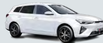
ARCTIC WHITE STANDARD PAINT

Make it your own. Choose from a range of dynamic, popular colours and finishes to suit every taste.