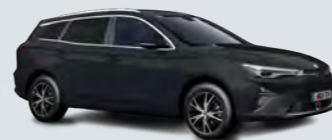
BLACK PEARL METALLIC PAINT*