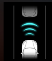
Intelligent Cruise Assist

For more information, please visit your local MG dealer.