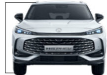
Front track 1590mm. Rear track 1584

Height - including roof rails 1664mm (Petrol) 1663mm (Plug-in Hybrid)