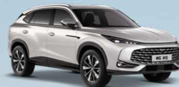
STERLING SILVER METALLIC PAINT*