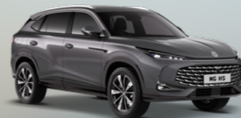
HAMPSTEAD GREY METALLIC PAINT*