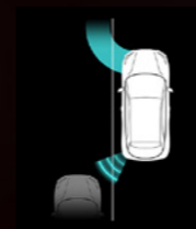
Lane Change Assist