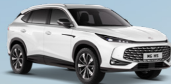
WHITE PEARL STANDARD PAINT

With a choice of five colours to choose from, you can make your MG HS a powerful expression of your personality.