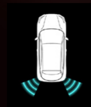
Blind Spot Detection