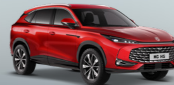
DYNAMIC RED TRI-COAT PAINT*

*Tri-coat and metallic paint optional at extra cost.