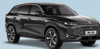
BLACK PEARL METALLIC PAINT*