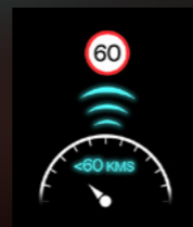
Intelligent Speed Limit Assist