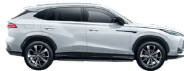
Wheelbase 2765mm Length 4655mm (Petrol) 4670 (Plug-in Hybrid)

Height - including roof rails 1664mm (Petrol) 1663mm (Plug-in Hybrid)