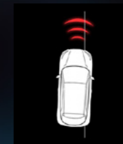
Lane Departure Warning System