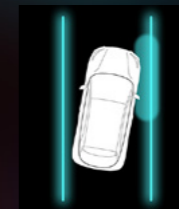
Lane Keep Assist