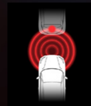
Forward Collision Warning