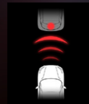
Active Emergency Braking (AEB)